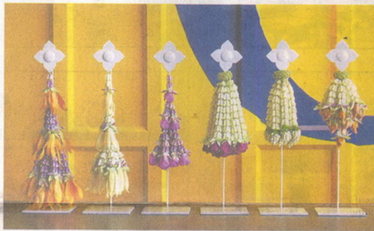
Various styles of traditional flower arrangement.