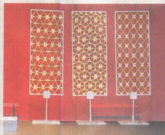
A set of traditionally designed floral arrangements adapted to fit modern tastes.