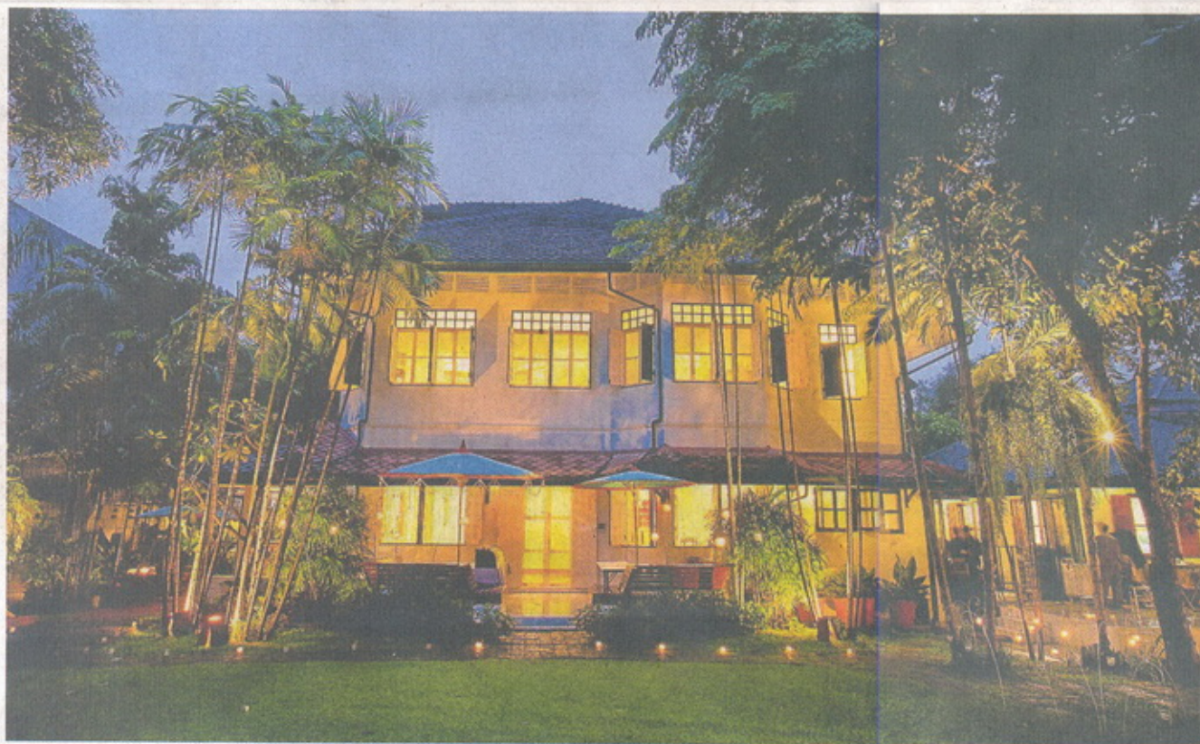
The Museum of Floral Culture is in Sriyan, Dusit district of Bangkok. Its vast botanical garden boasts plants that emit sweet fragrance.

In the museum's "Pen and Pencil Hall", Sakul has put on display a collection of his sketches, including the floral