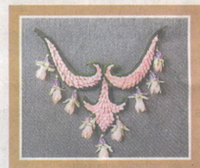
A decoration at the museum made from petals arranged in exotic patterns.

arrangement for the royal banquet held in the Grand Palace to celebrate the 60th anniversary of His Majesty's accession to the throne in 2006.