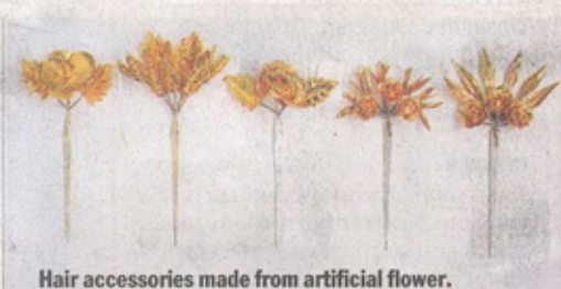
Hair accessories made from artificial flower.